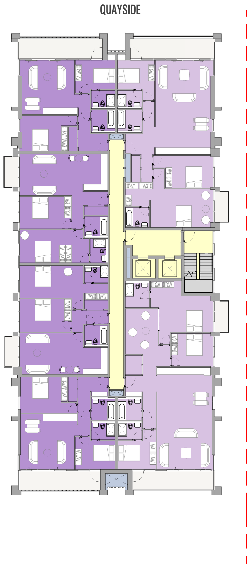
Block A-Penthouse Level 10 1 : 200