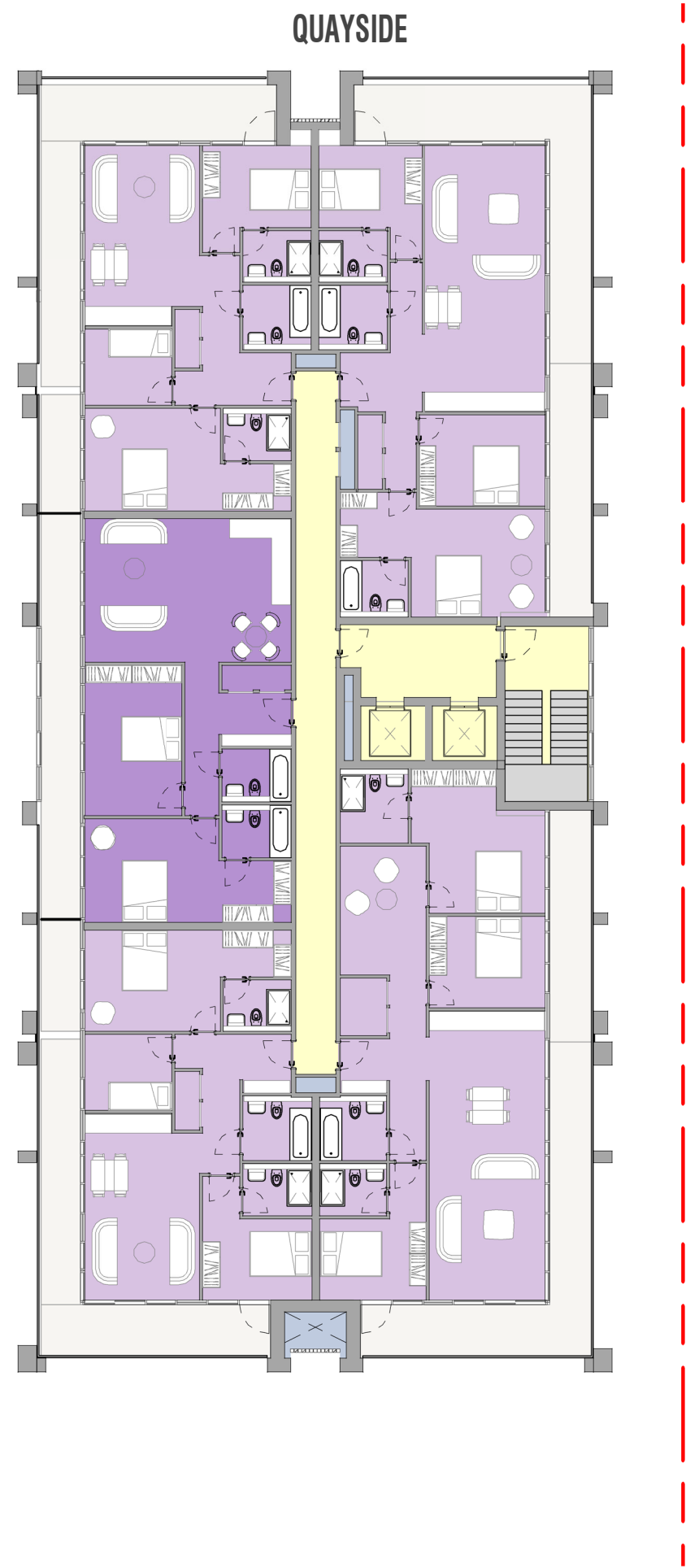
Block A - Penthouse Level 11 1 : 200