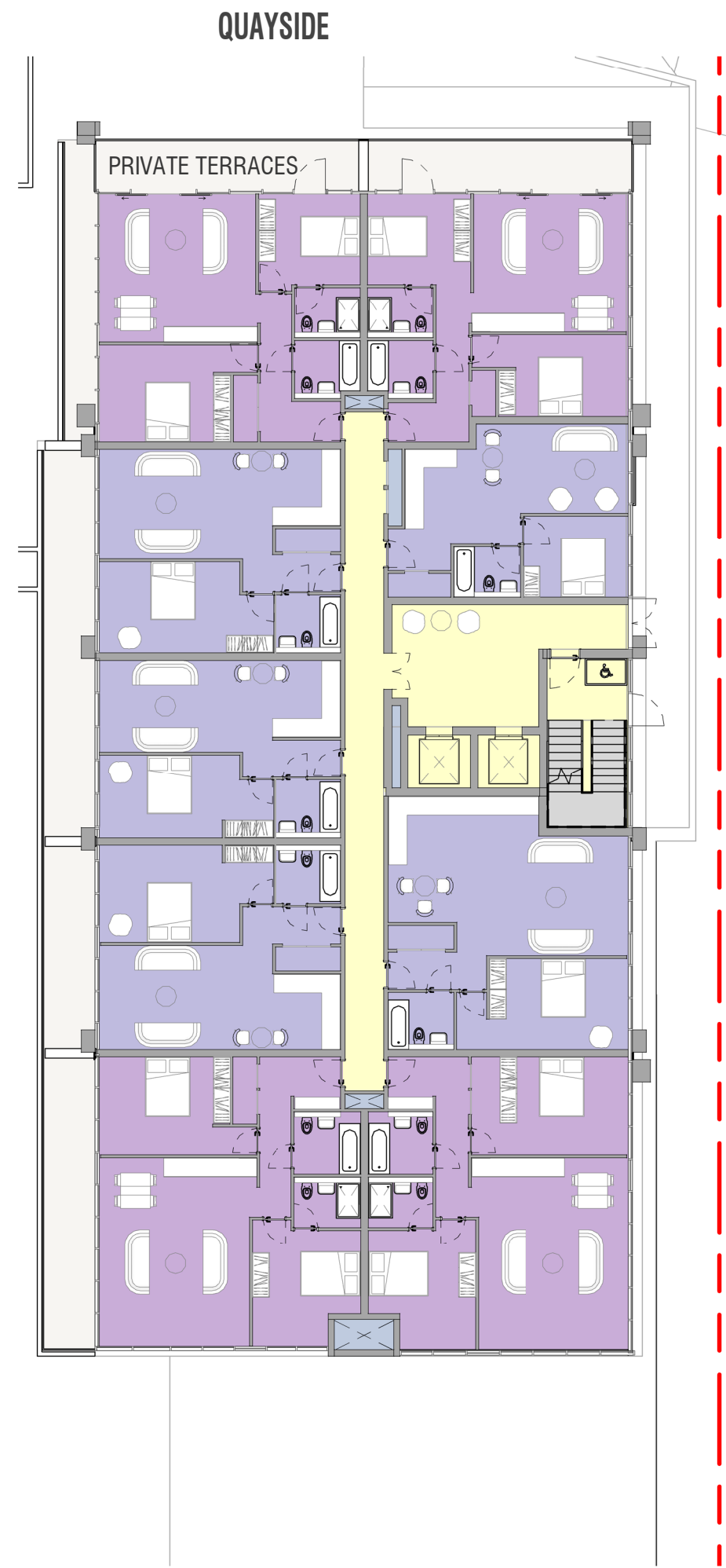
Block A - Level 01 1 : 200

Purpose of Issue PLANNING Project Status PLANNING