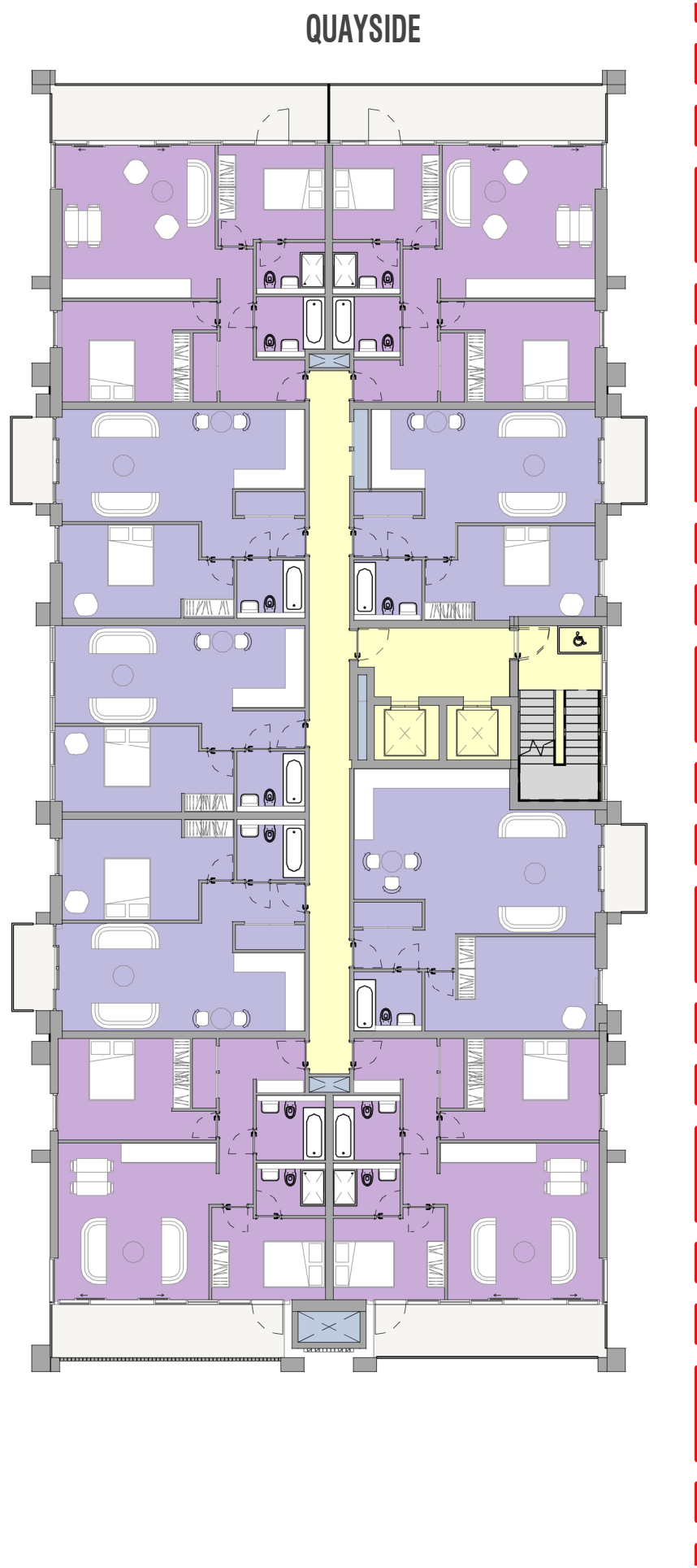
Block A - Typical Level 02-09 1 : 200